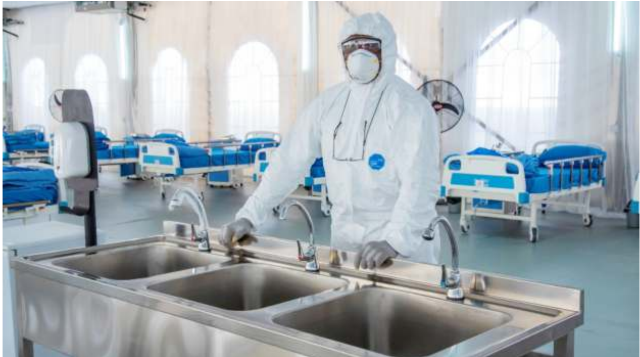
Covid-19 Isolation Centre

The year 2020 started on a brighter and prospective note for Nigeria with the expectation of increased economic activities, arising from the CBN's sustained interventions in agriculture and Small and Medium Enterprises (SMEs). Economic indices also attested to this until what was believed to be a localised virus in a town, Wuhan, in China, took on the world, ravaging not only economies but with millions of human casualties. Nigeria is battling to contain it, as no one expected its devastating destructive capacity. Other viruses like SARS and Ebola were not this destructive. It has no doubt brought unquantifiable damage to world's harmony and economic life.