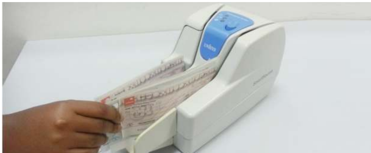
Cheque clearing machine

A s part of its efforts in the development of a safe and efficient payments system in Nigeria, the Central Bank of Nigeria (CBN) has lifted the temporary suspension it placed on cheque clearing in the country with effect from Tuesday, April 28, 2020.