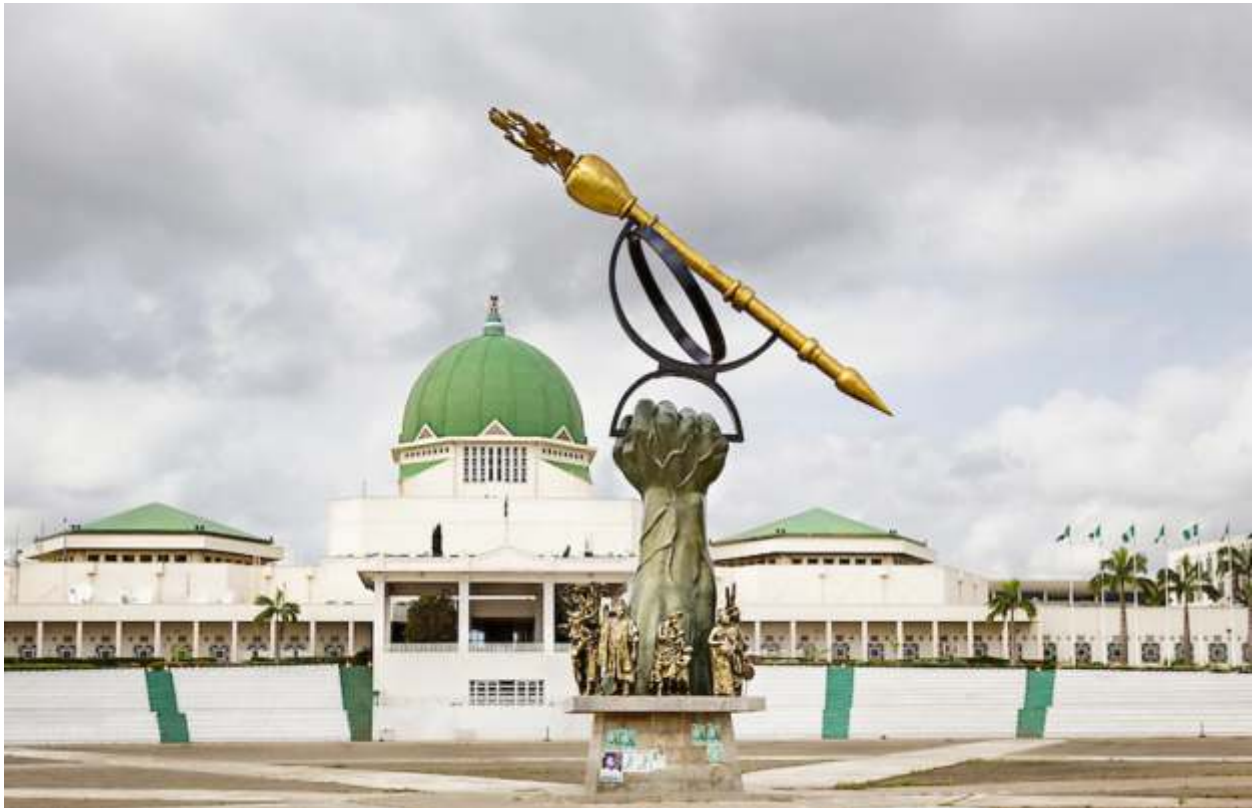
National Assembly Complex

T he Monetary Policy Committee (MPC) of the Central Bank of Nigeria, CBN, in its 129th communiqué, published on Wednesday, April 15, 2020, has urged the National Assembly (NASS) to fully cooperate with the Federal Government in coming up with a budget that reflects the new economic realities of the country.