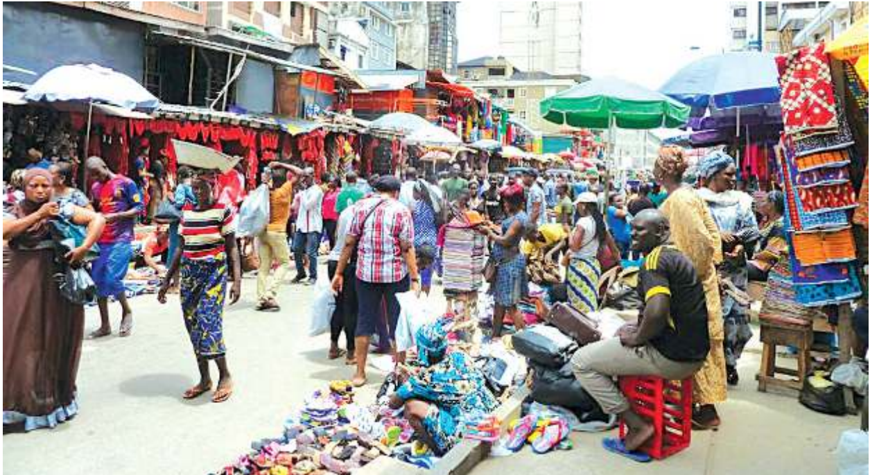
Lagos Island Market

The Federal Government has released guidelines to ease the lockdown imposed on FCT, Lagos and Ogun state. This was made public in a circular released on April 30, 2020 by the Secretary to the Government of the Federation, Mr. Boss Mustapha. According to the SGF, the gradual reopening of the economy will span a total of six weeks, broken into 3 sections of two weeks each.