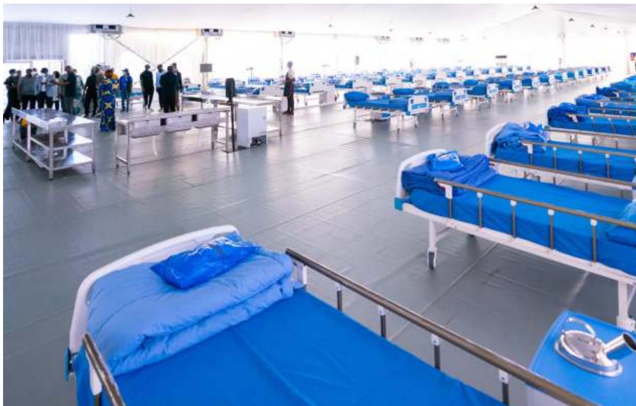
COVID-19 Isolation Centre, Lagos

The Central Bank of Nigeria's Governor, Mr. Godwin Emefiele, has led a delegation of the private sector-led coalition against COVID-19, CACOVID, on an inspection tour of the world class isolation center being built at the Mainland hospital in Yaba, Lagos State.