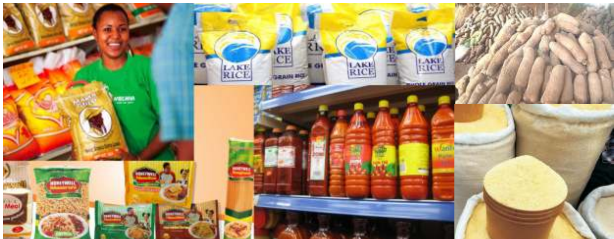
Food items for presentation as palliative

T he Governor of the Central Bank of Nigeria (CBN), Mr. Godwin Emefiele in conjunction with the Private Sector Coalition Against COVID-19 (CACOVID), is set to distribute N23 billion worth of food items to 10 million Nigerians as part of efforts to mitigate the effects of the virus on the people and the economy.