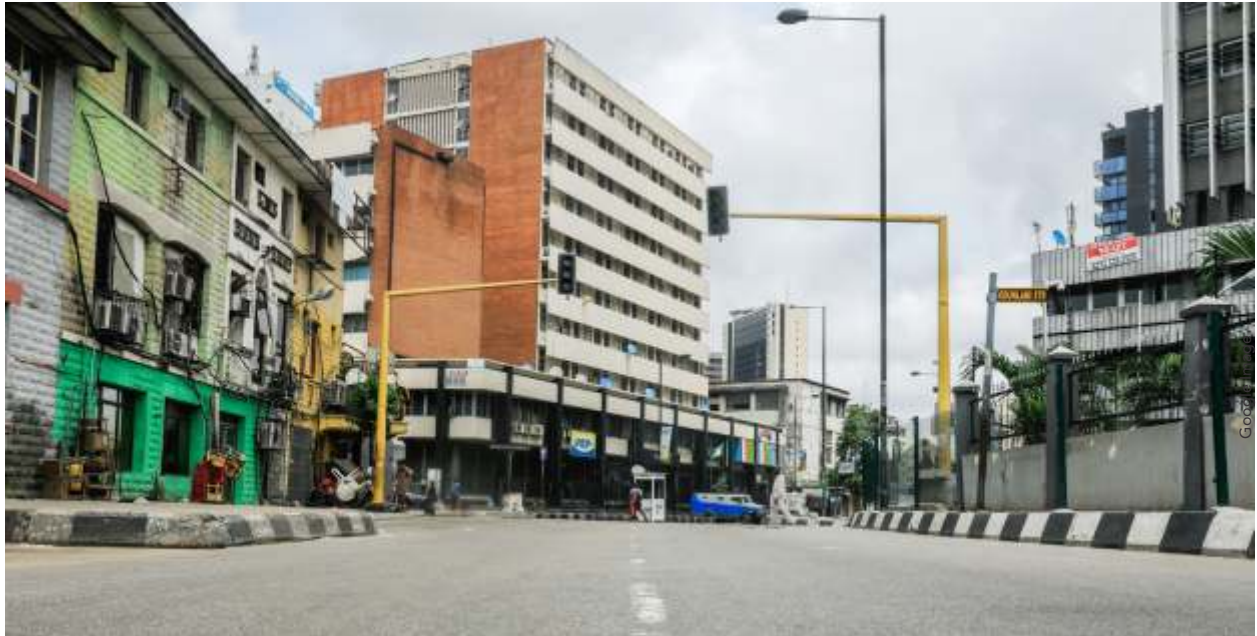
Broad Street, Lagos

The Central Bank of Nigeria (CBN) Governor, Mr. Godwin Emefiele, has assured investors of the security of their investments in Nigeria despite dwindling oil revenue in the country and the world at large. Mr. Emefiele spoke in Abuja, assuring that investors interested in repatriating their funds from Nigeria were guaranteed to get their money, notwithstanding the dip in revenue from crude oil. According to him, the Bank had put in place policies to ensure an orderly exit for those that might be interested in doing so. The Governor however urged investors to be patient as such repatriation are processed, owing to the Bank's policy of orderly exit of investments.