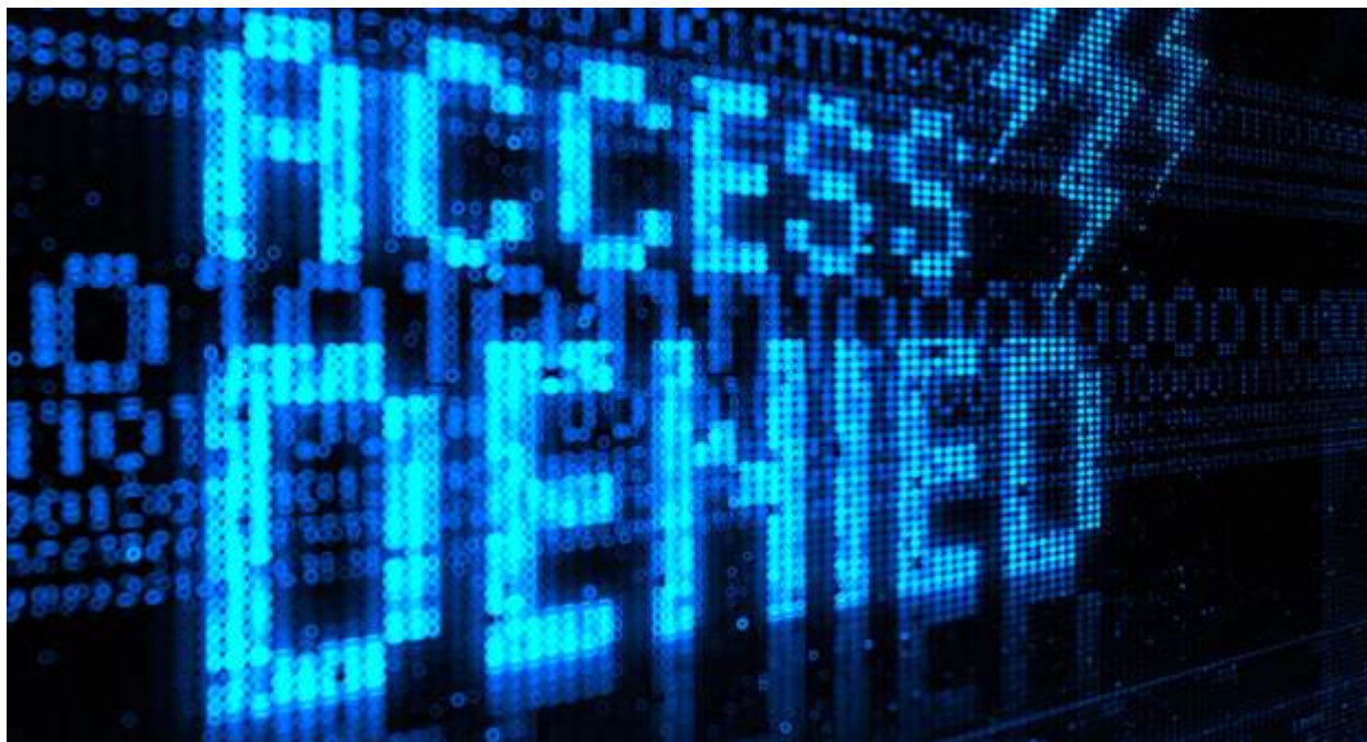
Secured Transaction Platform

The Central Bank of Nigeria (CBN) has alerted Nigerians of activities of cyber-criminals who are taking advantage of the current Coronavirus pandemic (COVID-19) to defraud citizens, steal sensitive information, or gain unauthorized access to computers or mobile devices using various techniques.